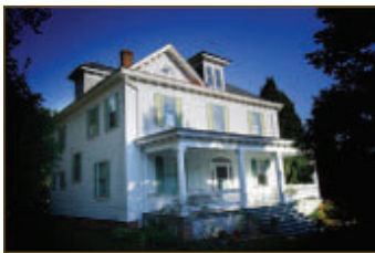
751 PARK STREET