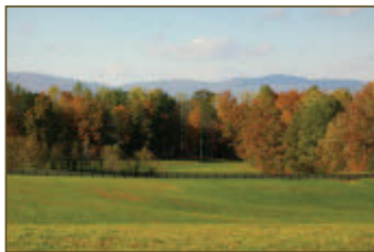
LAND NEXT TO FARMINGTON