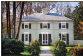
BLUE RIDGE NEIGHBORHOOD