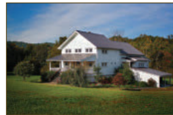
NORTH GARDEN FARM